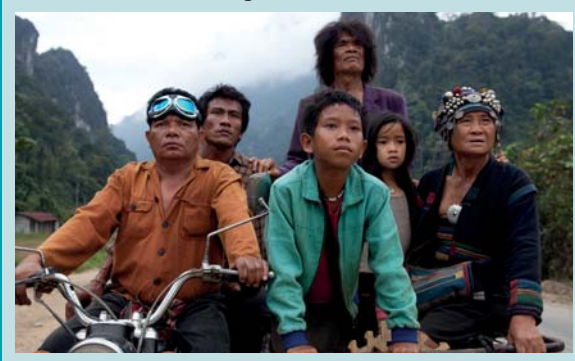
IDA (12A) Dr Pawel Pawlikowski Poland - 2014 (82m)

A boy, believed to be cursed, leads his family through war-torn Laos to find a new home. Along the way they come across a village holding an annual rocket-building contest.